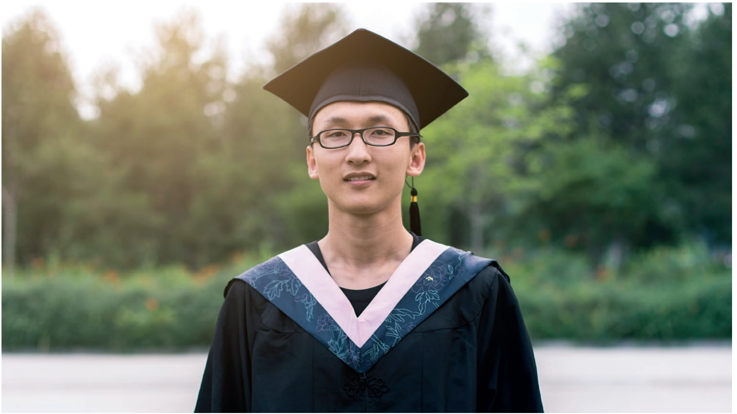
Many philanthropists support major institutions of higher education.